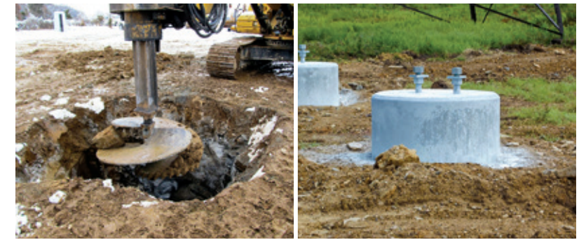
An auger (left) drills the hole for the concrete to be poured. The completed foundations (right) sit ready to support a new structure.

with the right of way agreement. (For further details, refer to the ROW brochure.) Trees along the edge, or just outside, of the right of way that could possibly fall and contact the transmission line are referred to as "danger trees" and will be trimmed and/or cut. Landowners will be notified prior to any activity.