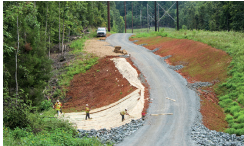
Crews install erosion control blankets (above) to protect the ground while new grass takes root (below).

Dominion Energy maintains transmission rights of way by removing inappropriate species of trees — those that grow too tall and could pose a hazard to the wires — and by removing weakened or dead trees that could topple onto wires.