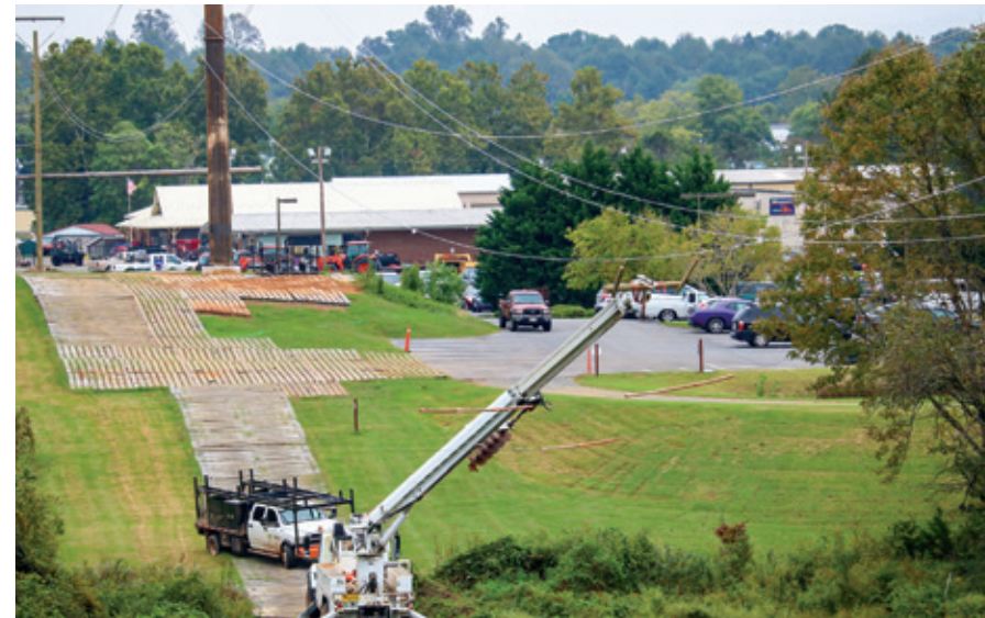
Wooden matting is placed to protect the right of way corridor during construction. After construction is completed, crews remove the matting and begin restoration of the right of way.

Soil boring testing helps ensure foundations will provide adequate stability for the transmission structures. Soil borings take place during the initial inspection or right after surveying and staking, but can also occur at any time