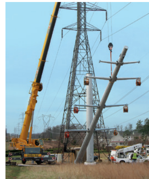
A crane raises a section of a monopole structure.

Generally, structures are built from the ground up. Structures are assembled in sections near the new structure location and a crane may be used to lift the structures in place.