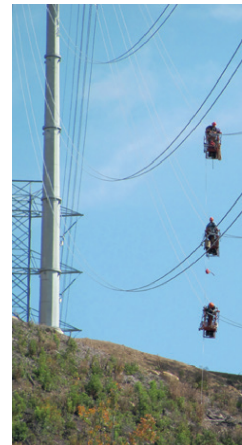
Linemen use wire carts to travel and inspect the newly installed conductor wire.